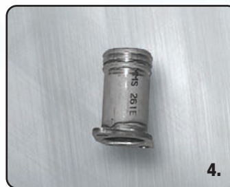
Riser - RH Cessna 150 and A150 Replaces: 0450338-70, 0450338-74 PN: A0450338-70 PMA New-outright: $59