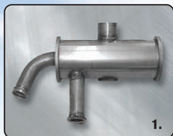
Muffler - LH Cessna 150 and A150 Replaces: 0450400-3 PN: A0450400-3 PMA New-outright: $325