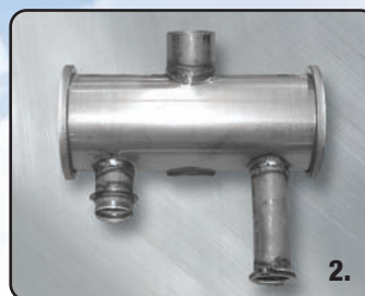
Muffler - RH Cessna 150 and A150 Replaces: 0450400-26 PN: A0450400-26 PMA New-outright: $325