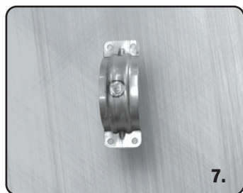
Tailpipe Clamp with Pin Cessna 150 and A150 Replaces: 0450338-9 PN: A0450338-9 PMA New-outright: $19 Can be used for both left and right sides.