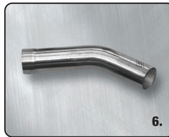
Tailpipe - RH Cessna 150 and A150 Replaces: 0450338-66 PN: A0450338-66 PMA New-outright: $82