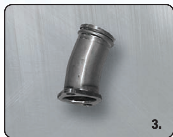
Riser - LH Cessna 150 and A150 Replaces: 0450338-69, 0450338-76 PN: A0450338-69 PMA New-outright: $72