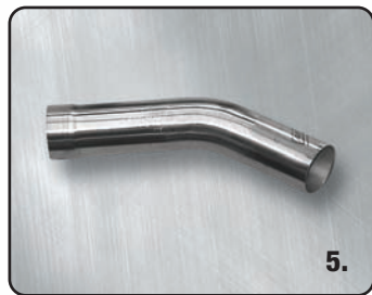
Tailpipe - LH Cessna 150 and A150 Replaces: 0450338-67 PN: A0450338-67 PMA New-outright: $82